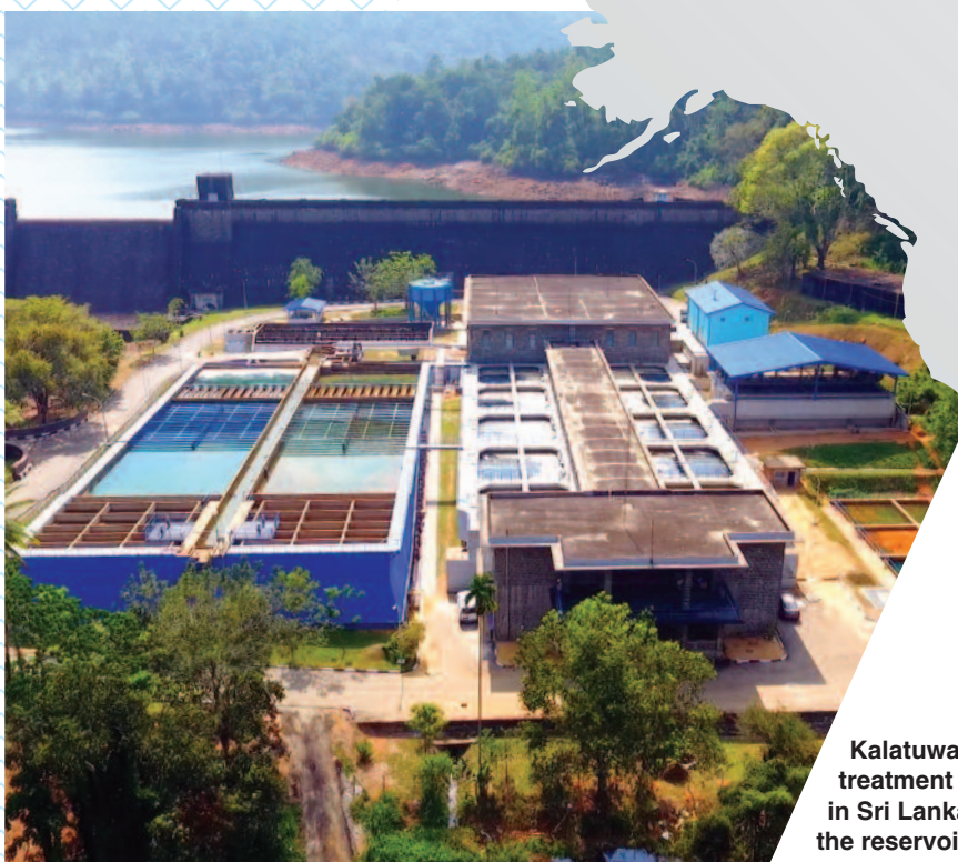
Kalatuwawa water treatment plant in Sri Lanka with the reservoir