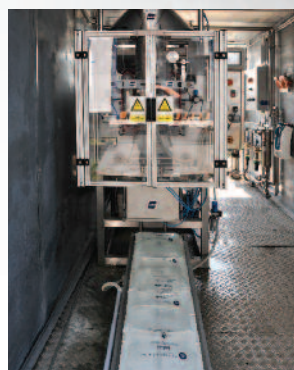
← Water packaging equipment