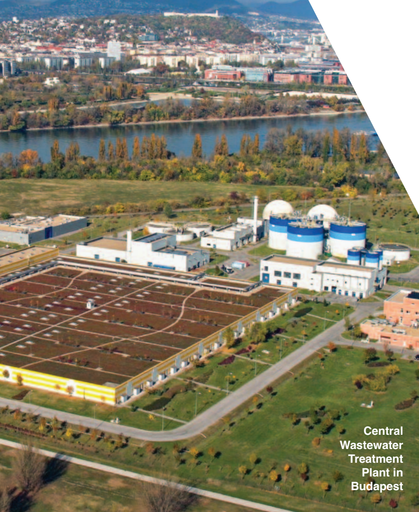
Central Wastewater Treatment Plant in Budapest