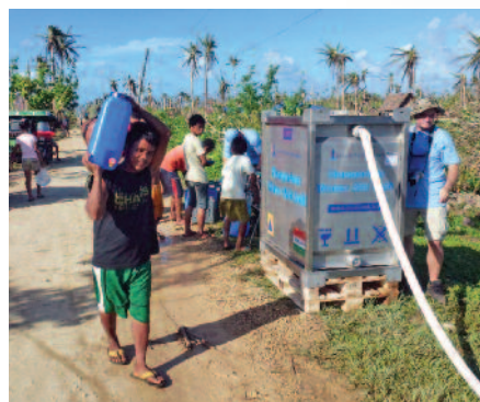
← Mobile water purification, Philippines

They can produce and package potable water from any water source of any contamination level, thanks to the engineering expertise and technology incorporated into them, which is unique in world comparison.